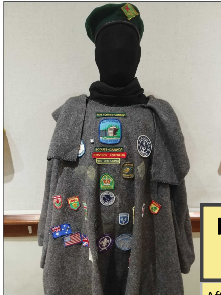
Uniforms, badges, and more in the new exhibit on Oliver's Scouting history.

As camping season gets underway, a new exhibit on Scouting history is brightening up the Museum's temporary exhibit gallery. 2020 marks the 110th year of Boy Scouts/Scouts Canada in the South Okanagan, and from June to September the Museum will be offering the exhibit "Scouting in Oliver," a look back at Scouting and some of the men, women, children and teens who were involved in local Scout troops. It's a little-known fact that numerous Oliver residents rose through the ranks of Scouting to achieve impressive standing in the organization both as youth members and adult leaders. The ODHS collection contains a number of mementos and objects from these high-achieving indi-