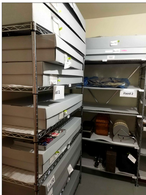
The textile storage project in progress

The goal of this phase was to start putting all of the textiles in the collection (anything made from fabrics, leath-