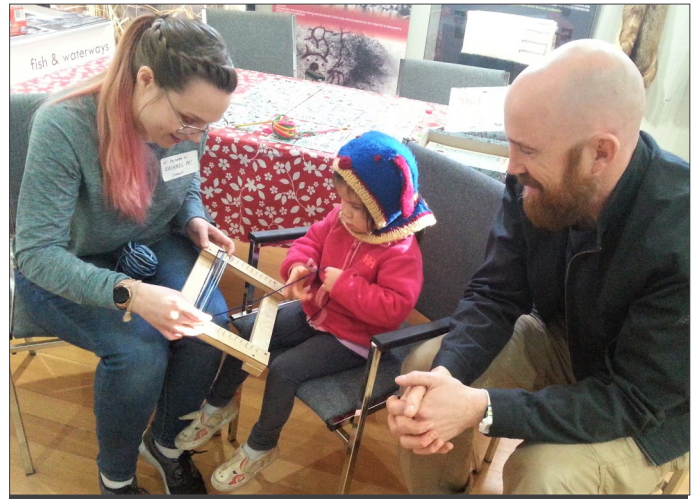
Learning hand loom weaving at the Museum's Old-Fashioned Family Fun Day.

This year the Museum's Family Day event took place on Sunday, February 16th from 1-4pm. At the event, guests were invited to participate in 4 different crafts and to play board games. The crafts available were: popsicle stick catapult building with a target and testing area, family tree building, crafting leather bracelets by braiding or hot stamping, and weaving on a loom. In addition to the crafts and board games, snacks and juice boxes were provided free. While some activities took place in the main gallery, there was still room for visitors to explore the Museum and the Selfie Station was up and running. The event was mainly attended by families with younger children, but kids and adults alike enjoyed the activities. At the end of the day, the crafts provided a great souvenir to take home.