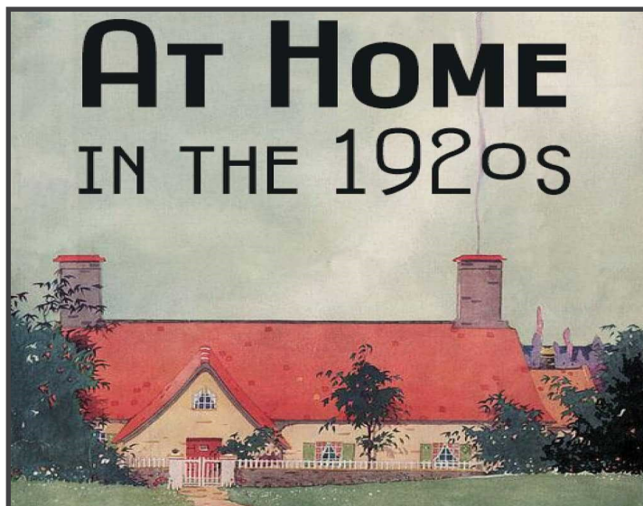
“At Home in the 1920s” was displayed in the Venables Theatre lobby from January until May.

Along with an introduction to domestic life in the Roaring ‘20s, each item in the display was accompanied by a brief description explaining why it was significant to the decade. Many of the items were also displayed alongside vintage ads. This lively little exhibit remained at the theatre until the end of May, and is part of our efforts to bring our artifacts to the broader Oliver community for all to learn from and enjoy.