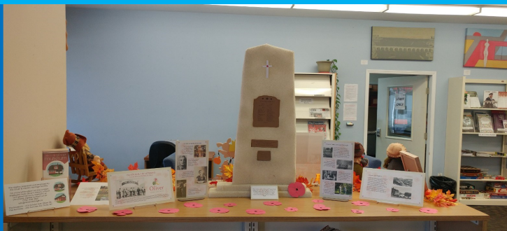
A model of the Oliver cenotaph in a Library display

Have you been to the Oliver branch of the Okanagan Regional Library recently? If you have, you might have noticed a miniature exhibit set up by Heritage Society staff that changes regularly. The displays started in September and will be continuing into the new year. Each exhibit has a theme: in September we focused on school days and our new "Old School" teaching kit, in October things got spooky with a Halloween display, in November our intern offered a look at some of the veterans and wartime contributors who made Oliver what it is today, and coming up in December there will be a festive display of vintage holiday cards and some information on their origin. Keep an eye out for these displays the next time you visit the library, you might just learn something!