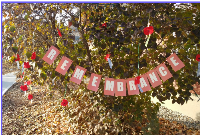
Left: Tuc-el-Nuit Elementary School students make poppies to hang on the Tree of Remembrance (above).

selected veterans who came to Oliver after the First World War and some of the individuals from Oliver who served or contributed during World War II. The booklet is a way to remember Oliver's past and the sacrifices previous generations made. Copies of "Remembering" are available at the Oliver Museum, the Oliver Legion, and the Library during November. They are also on our website at www.oliverheritage.ca . We are pleased to be able to share these projects and encouraged by how well they've been received by the community.