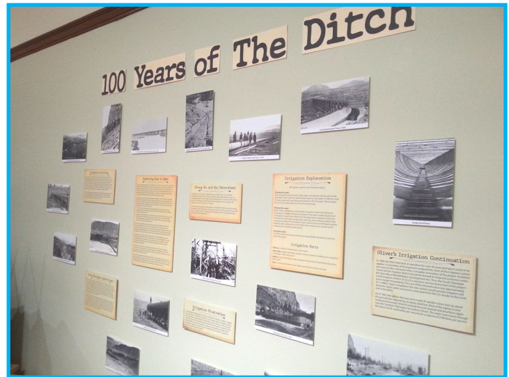
A display details irrigation history in the Oliver area

John Oliver. The "100 Years of the Ditch" display will be open for viewing until the spring of 2020.