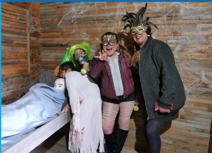
Guests pose in the Jail for Halloween photos

This year for Halloween, the Museum took guests back in time to 1924. Based on a 1924 "Bogie Book", the 1920s-era building was decorated with vintage wall-hangings, streamers, and lots of black and orange. On Oct. 27th, guests enjoyed paper hat-making, fortune-telling, carnival-style games, Halloween treats, a scavenger hunt, and costume photography in the Fairview Jail. There was also a door prize awarded to one lucky guest containing passes to the Oliver Theatre. The event was well-attended with 40 - 50 guests and almost everyone showing up