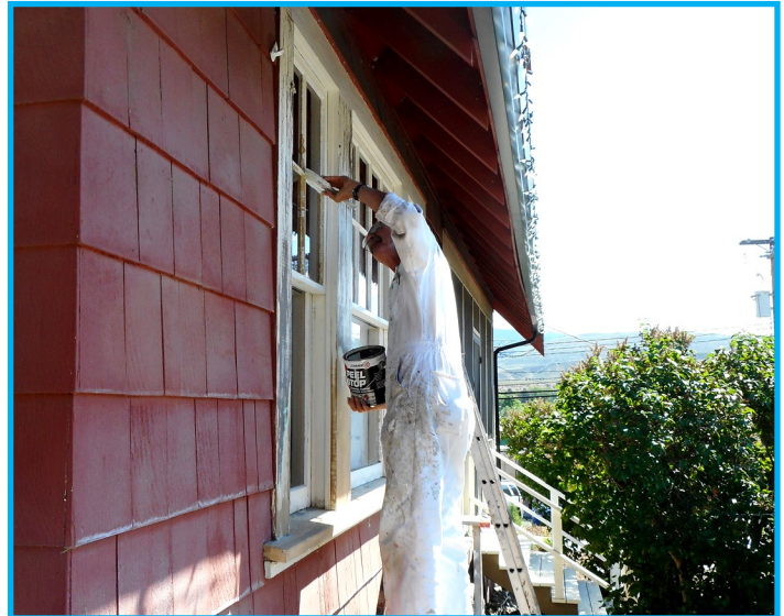
Five original 1924 wood windows were restored, primed, and repainted this spring, and the rest will follow next year.

The grant will help to preserve the heritage building for future generations. It will also produce a better environment for artifacts, helping the ODHS to better serve Oliver and preserve its history.